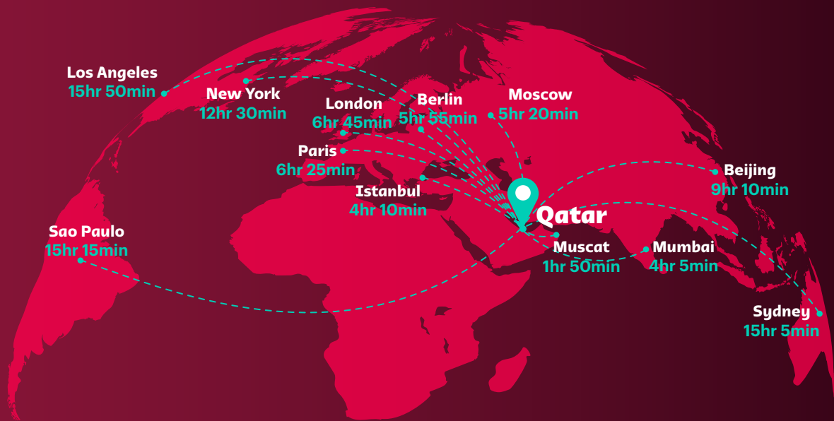
Selected flight times to Doha

Qatar is a major transport hub and a central transfer link connecting the Americas, Africa, Europe and Asia. Flights from hundreds of destinations stop in Qatar.